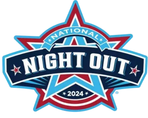
POLICE - COMMUNITY PARTNERSHIPS

As for crime fighting we've had several successful operations throughout the city from bus stops, to warrant roundups and bait cars.